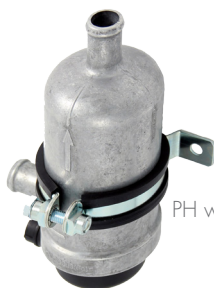
PH with bracket PH Pro